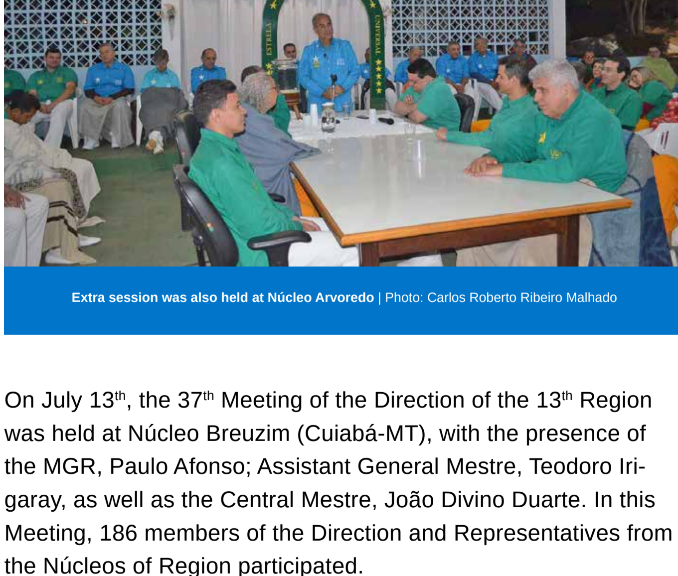
Extra session was also held at Núcleo Arvoredo