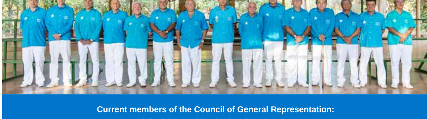
Current members of the Council of General Representation: restored decision-making body.

Conage unanimously approved the restoration of the Council of General Representation, constituted by the members of the General Representation, Mestres who are members of the Council of the Recordation of the Teachings of Mestre Gabriel, Mestres who occupied the place of General Representative Mestre and permanent members of Conage.