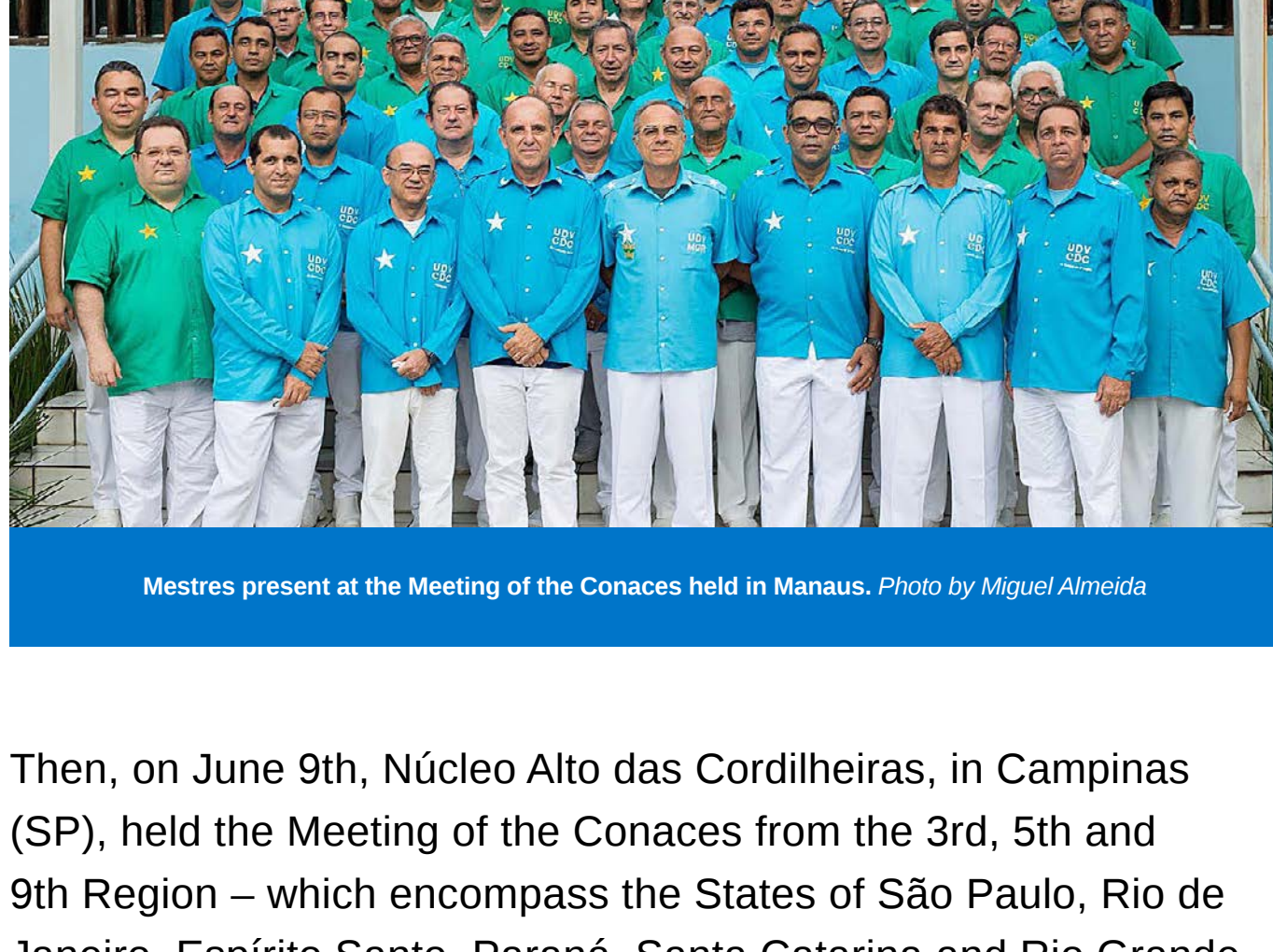
Mestres present at the Meeting of the Conaces held in Manaus.

On May 25th and 26th, 2018, the Meeting between the General Representation, the General Directorate and the Conaces of the 2nd, 14th and 16th Region (located in the States of Amazonas, Pará, Amapá and Roraima) took place in Núcleo Tiuaco, with the presence of 85 Mestres.