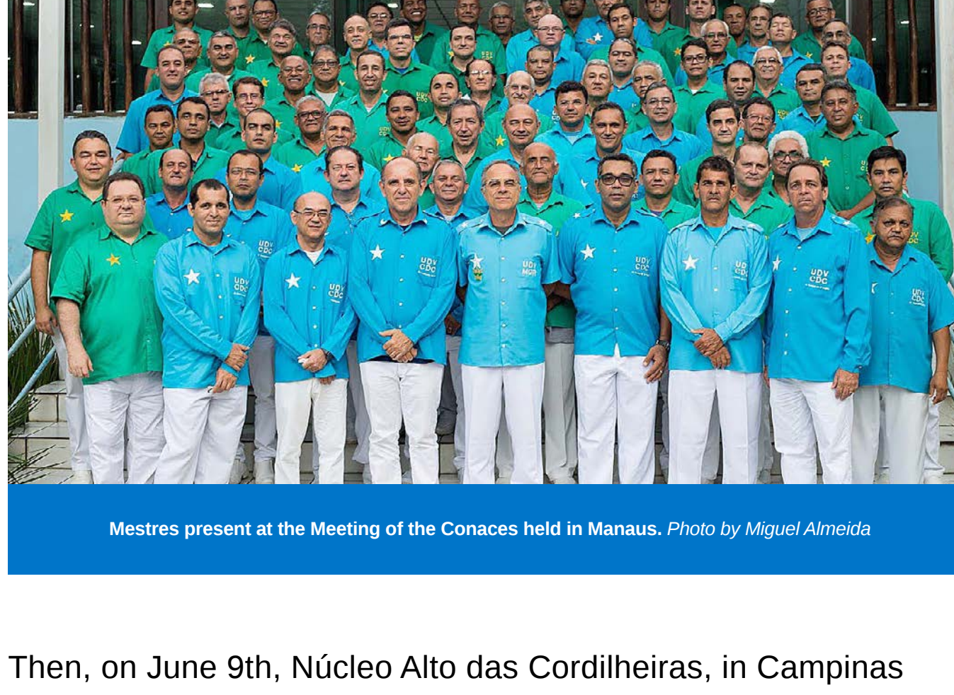
(SP), held the Meeting of the Conaces from the 3rd, 5th and

On May 25th and 26th, 2018, the Meeting between the General Representation, the General Directorate and the Conaces of the 2nd, 14th and 16th Region (located in the States of Amazonas, Pará, Amapá and Roraima) took place in Núcleo Tiuaco, with the presence of 85 Mestres.