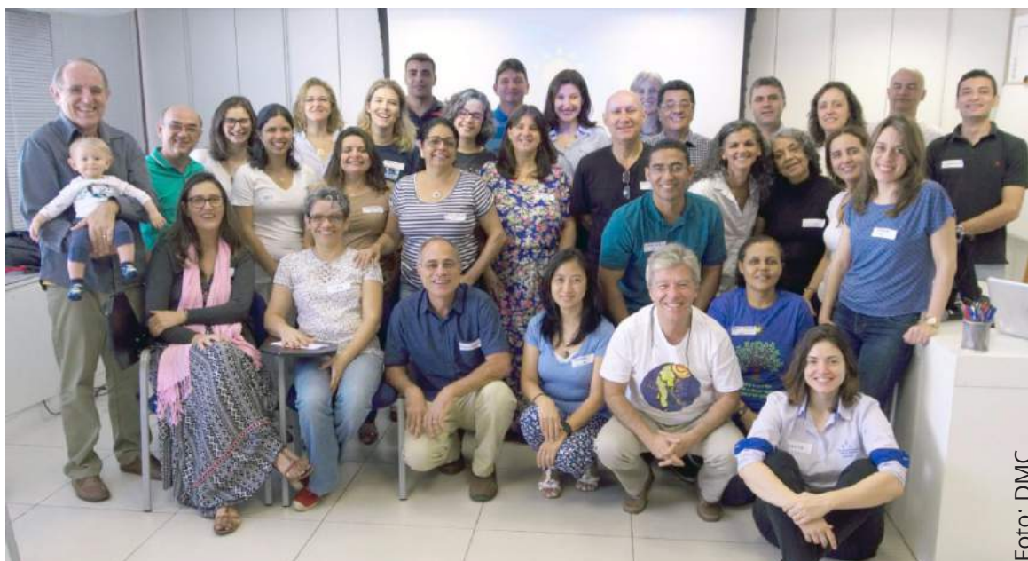
Meeting of the General Secretariat and the Regional Secretaries from all the Regions

On May 5th and 6th, a meeting of the General Secretariat and the Regional Secretaries from all Regions was held, having the Regional Triennial Report, Reuni and the Secretary Manual as the main points of the agenda.